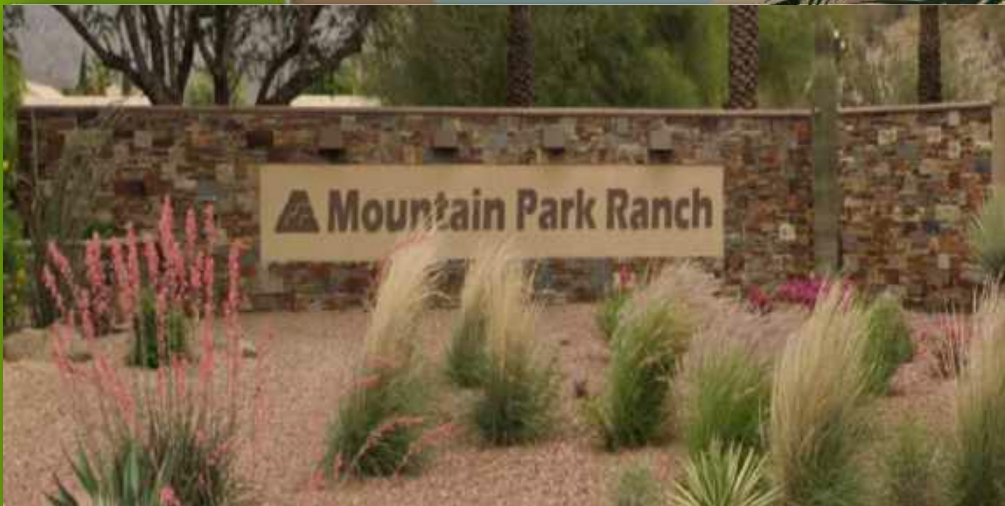
Mountain Park Ranch