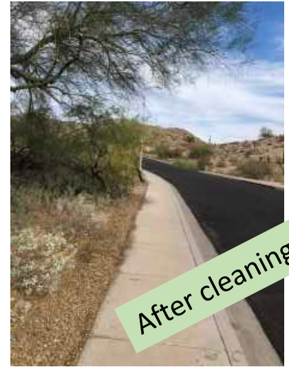
Cleaned walkways along north 32 nd street from generated WO 1/29/2021

Tree Trim and removals came from generated WO completed this month