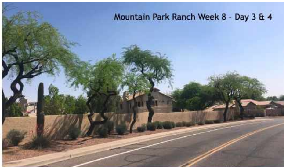
Mountain Park Ranch Week 8 - Day 3 & 4