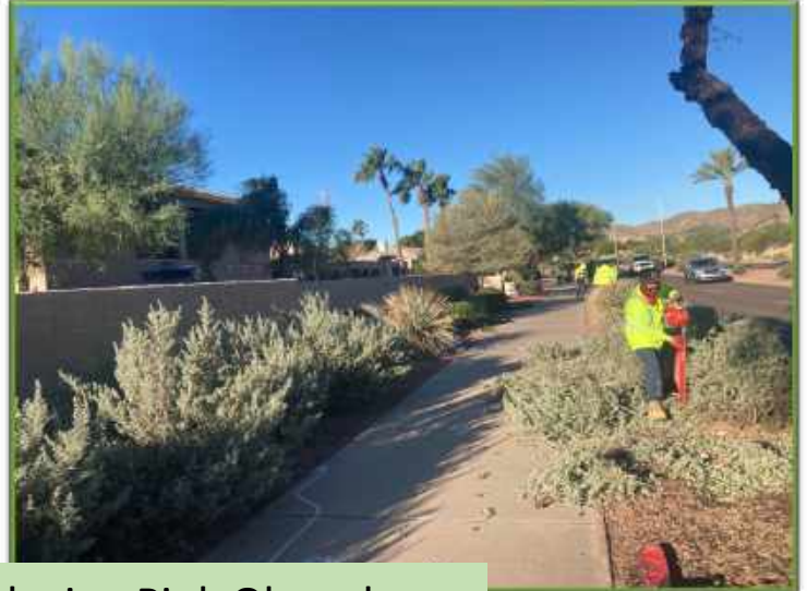
Continuing our trim cycles: reducing Pink Oleanders, Mexican Bird of Paradise, Grasses and Sages