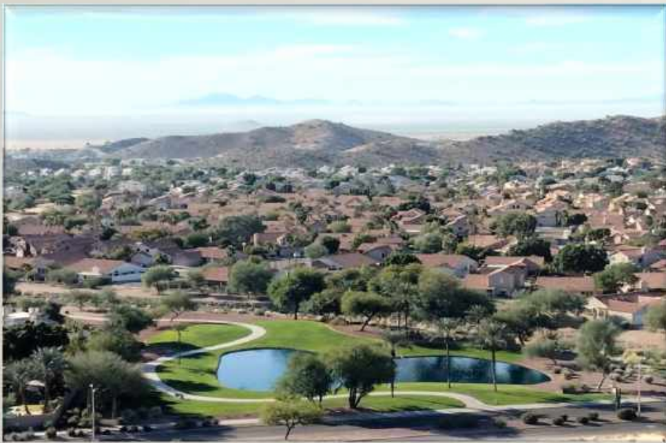
Mountain Park Ranch

November 2022 Landscape Management Update