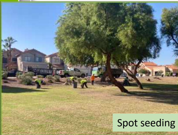
Spot seeding and mulching