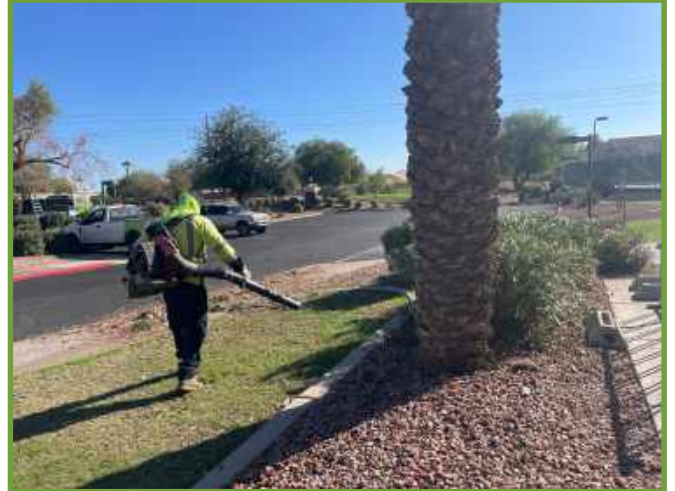
Recreation center #2 & Ranch Circle North SLM process