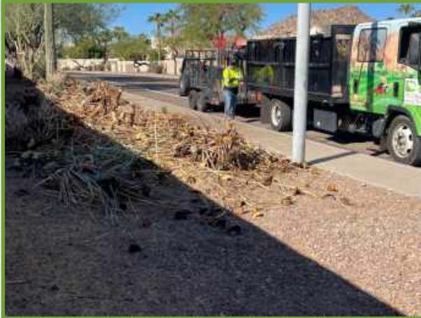
Plant material lost from the extreme heat