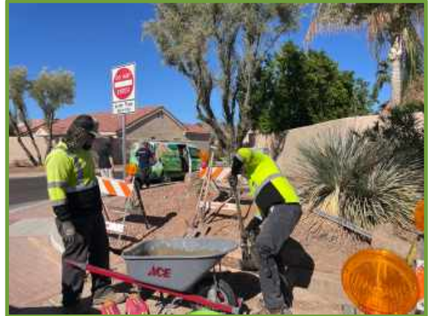
Backflow repair from the city Mainline rupture that the City didn't repair after 4 weeks PQ stepped in and made the needed repairs.