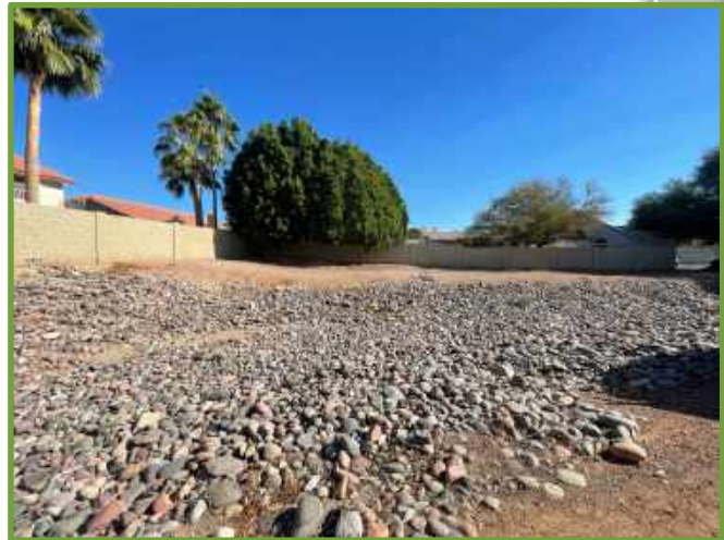
This months wash cleanings