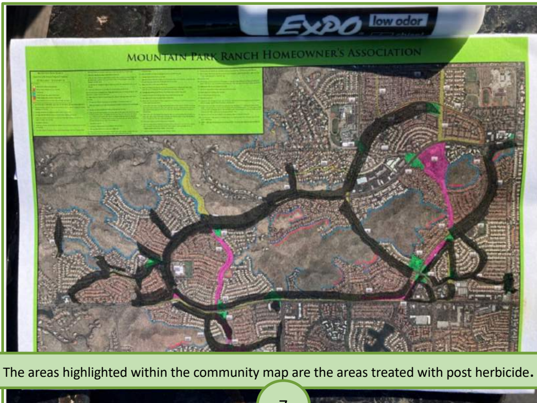
The areas highlighted within the community map are the areas treated with post herbicide.

Photo 1 Have all areas been completed? No, we will have to come back Map of Area Completed today