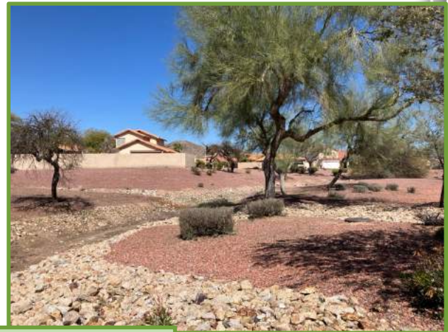
This month's wash cleanings